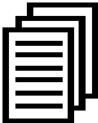
Figure 6 A part of system.conf

Some zonedata is available in the file .. /dahdi-XX/tools/zonedata.c, you can refer to it to match your country mode. Meanwhile, you also need to modify another parameter which is in file /etc/asterisk/indications.conf.