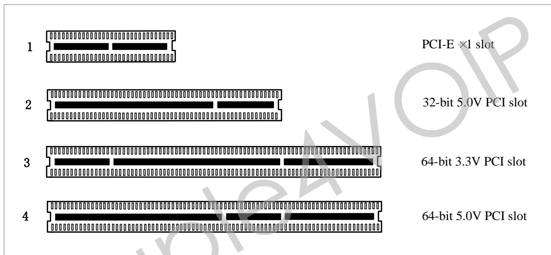
Figure 2 PCI-E and PCI slot

D130E is compatible with PCI-E \times 1 (slot 1) and \times 2 , \times 4 , \times 8 , \times 16 slot except PCI slot; you should confirm your slot type and insert D130E into any type of PCI-E slot as previously described.