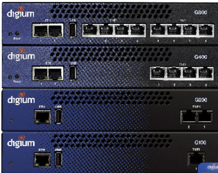
The Digium family of gateways

Deployed in any application, Digium gateways will provide proven reliability for a fraction of the cost of other gateway platforms on the market. The easy to setup gateways and API will reduce administration and troubleshooting costs for any organization, from a small business to a large enterprise.